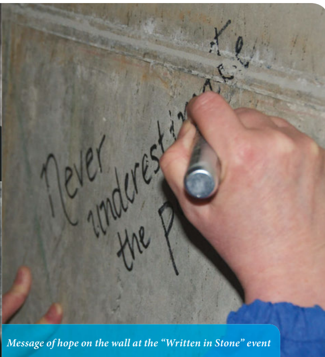
Message of hope on the wall at the "Written in Stone" event

event was such a success that it is now included in the building process of every new RBSE facility.